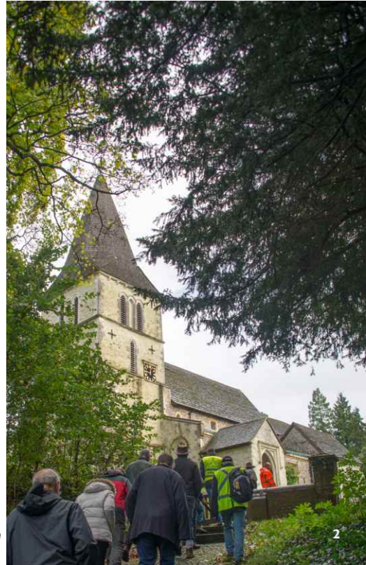
St Katharine's Church, Merstham

If you walk down to the Old Forge, which is on the right hand side of the street you will see a footpath straight in front of you, which takes you over the M25 and past a pond on the left (the site of a former watermill). The path ends at a road. Cross this road with extreme care and climb the steps to St Katharine's Church, Merstham. The church was built in the Thirteenth Century of flint and Merstham Stone. The church is usually open, so please try the door and take a look around. The bells date from the Fourteenth Century.