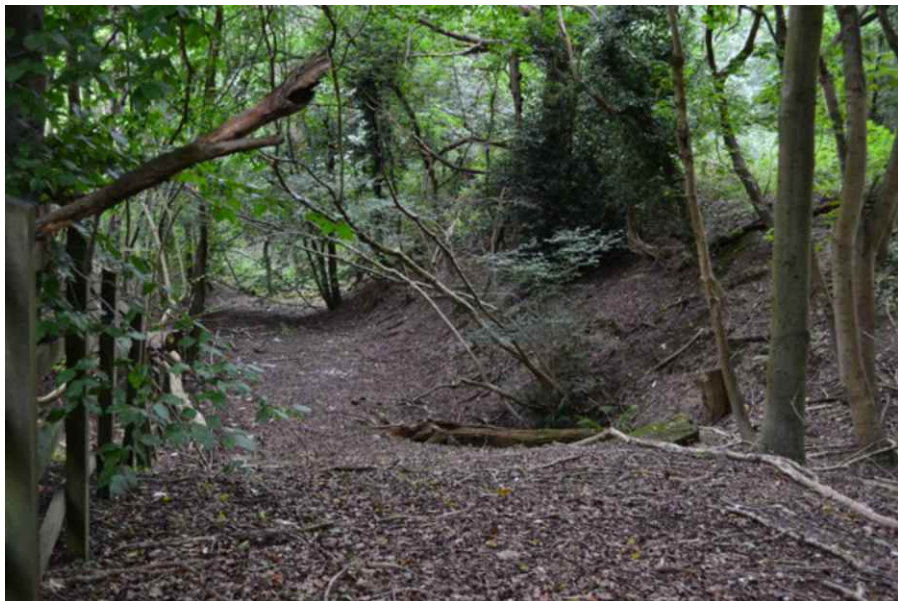
CM & GIR Railway Cutting

This is the end of the walk. There is a nearby bus stop where the 405 will take you back to Merstham; or you can walk back along the A23.