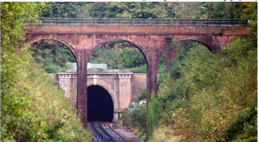
Looking north from Merstham Station, the Greystone Lime Works line turns off to the right before the brick over-bridge (Jolliffe Road)

Leave the churchyard and with care cross the A23 at the traffic island and walk back towards Merstham. When you reach Rockshaw Road cross the road to walk up the pavement side to a railway bridge. Stop on the railway bridge, this is the original London to Brighton line opened in 1841. Look north towards the tunnel and you will notice that there used to be tracks to the right of the present line rising gently and turning right before the tunnel. This was the former Greystone Lime Works line of which more later. Walk on ahead to the second railway bridge, this is the Quarry Line which bypasses Redhill, and was opened in 1899.