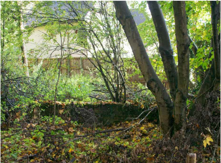
Remains of CM & GIR Railway Bridge

Continue to the end of the row of houses. Just after the last building there is the remains of a bridge. The top of the brickwork can be seen in the undergrowth. A path used to run at right angles to London Road and the CM&GIR passed under the bridge. Continue along London Road and you will see a deep cutting on the right where the CM&GIR used to run. This section of cutting ends where the A23 has been built over it.